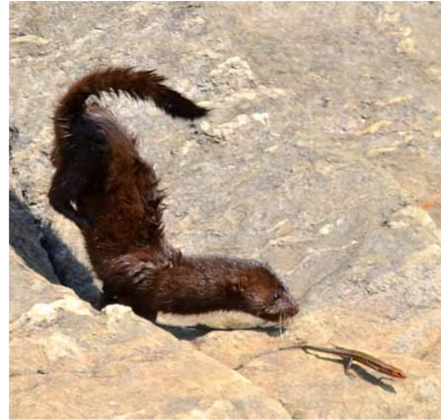
The mink is a shoreline animal and eats whatever it can find.