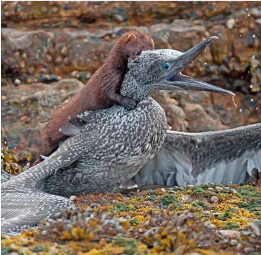
The mink is an effective predator and can take prey much larger than itself. Here a northern gannet.