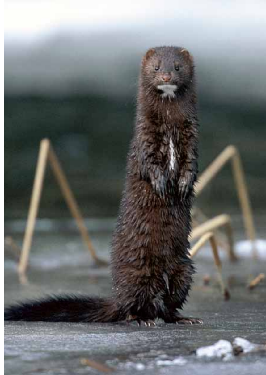
The white spot is a typical feature of the mink.

The mink belongs to the family of mustelids and has a long and slim body with short legs. The color may vary, but is usually dark brown with a white spot on the chin. The total length of a male (including the tail) is between 45–75 cm, and of a female 45–65 cm. Males weigh 0.7–1.5 kg and females 0.5–0.8 kg.